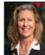
Susan Candell, City of Lafayette Councilmember