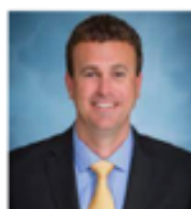
Nils Nehrenheim, City of Redondo Beach Councilmember