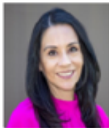
Jovita Mendoza, City of Brentwood Councilmember